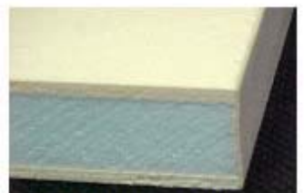
Edge Treatment Veneer Band