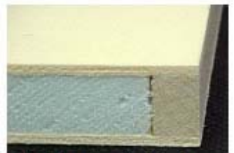
Edge Treatment - Inside Lumber Band