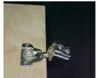
Euro Hinge Alternate Views

The ability to remove a small area of the core and one side allows for the attachment by glue and nails a wooden strip to serve as a post to provide the means to attach panels with other material.