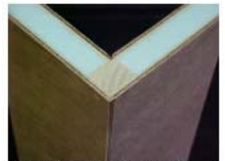
Inside Corner Post Joint