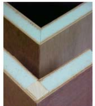
Inside Corner Post Miter Joint