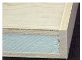
Edge Lumber Band