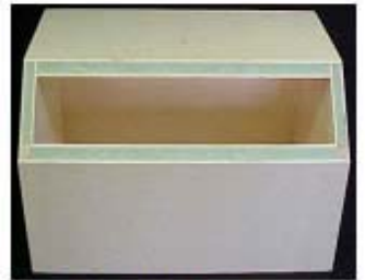
Box Cut Away View