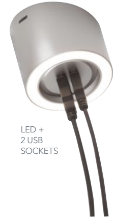
LED + 2 USB SOCKETS