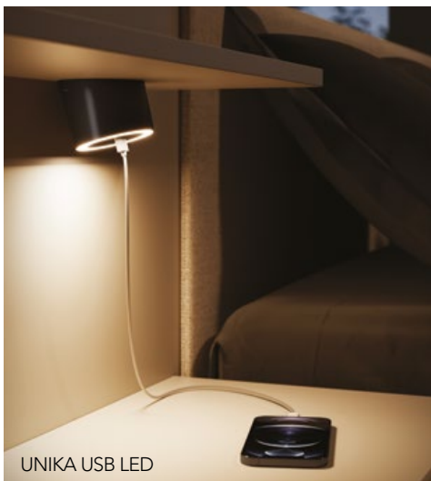
UNIKA USB LED

Combining a minimal look with advanced functions in a solution that offers two configurations: Unika LED light and Unika LED light with double rapid-charge USB sockets. All this is contained in a tilted cylindrical body with a simple design, perfect for installing on back walls under cabinets or above shelves. Ideal for the hospitality industry.