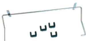
No. 44962G Bracket for kick plate

The kick-plate bracket allows you to hide the step stool behind the baseboard. Order separately.