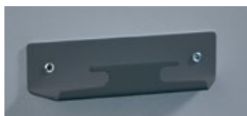
No. 4495905 Wall support - graphite