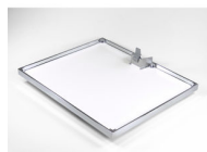
Individual Basket for Convoy Lavid System