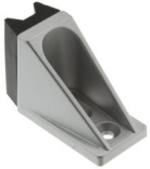
Bottom door stop with centering assembly Product # 8920773174