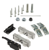
HAWA JUNIOR 80/Z Hardware Set with One Track Stoppers Product # 8911705