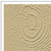
Teak and Oak