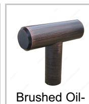
Brushed Oil- Rubbed Bronze