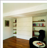
Screen Panel / Standard Access Door / Pocket Door