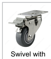
Swivel with Brake